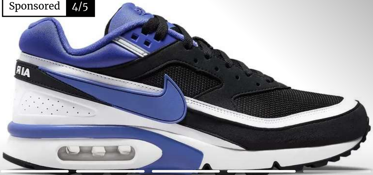
Nike Air Max BW OG Persian Violet