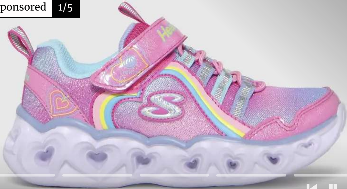
SKECHERS Pink Heart Lights Rainbow Lux Trainers Junior