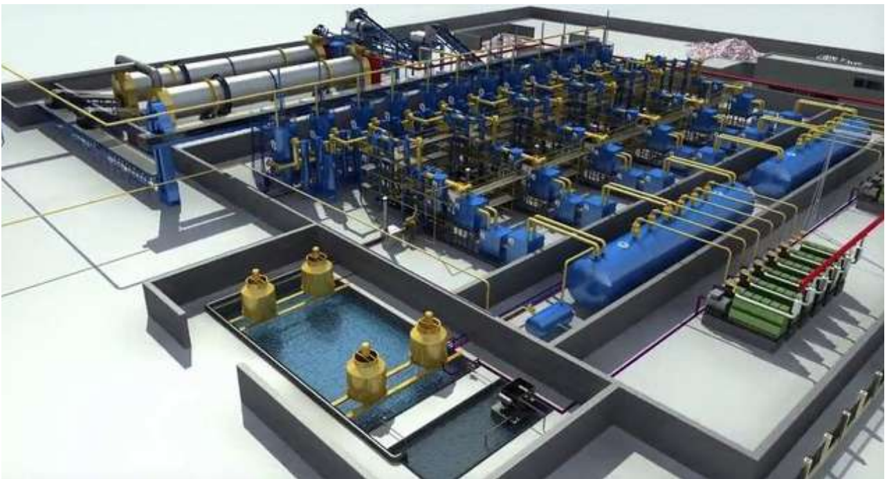
An artist's impression of the proposed green energy village in Aberdeenshire, which will employ multiple

Updated Wednesday, 2nd December 2020, 2:44 pm