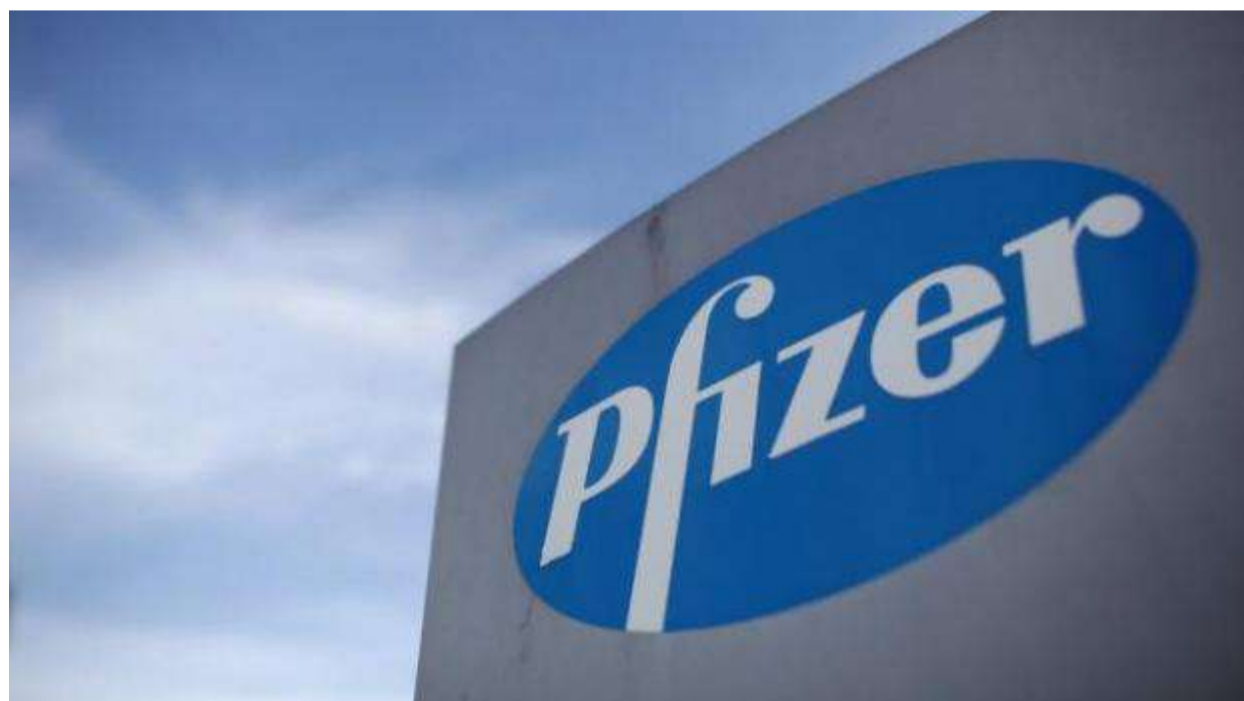
The vaccine is set to be rolled out