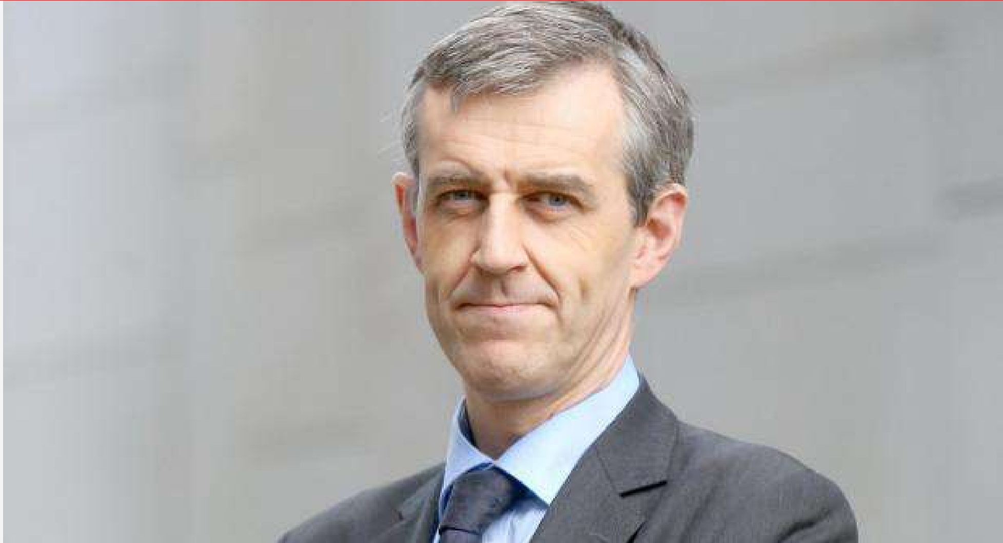
Tom Gordon: SNP-Green deal contains poison for independence

WHAT to make of the joint government deal between the SNP and the Gre