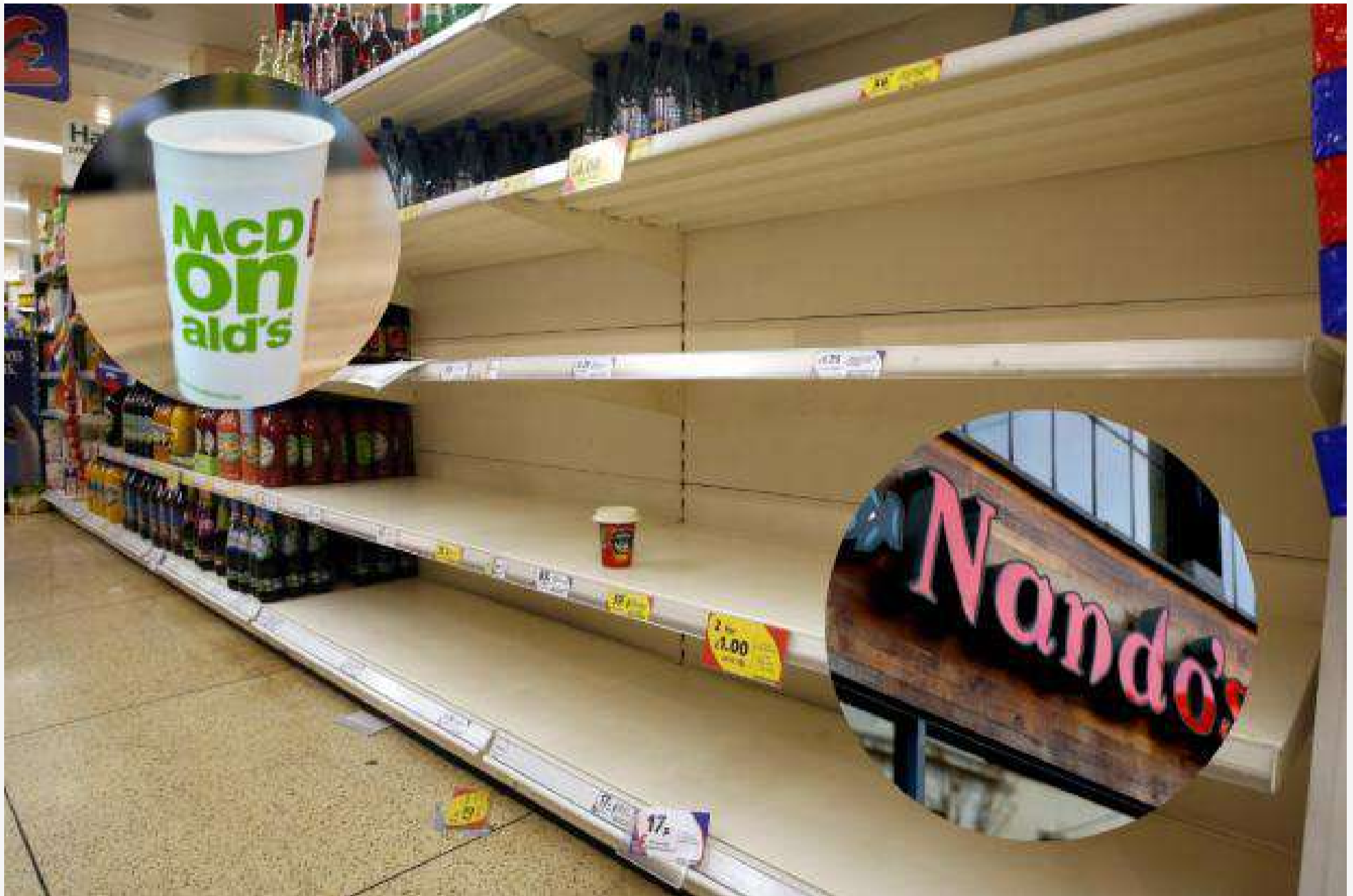
Brexit food shortages: Here's why Nando's, McDonald's and supermarkets face problems

Food shortages have hit the UK, and it's largely due to Brexit, according to