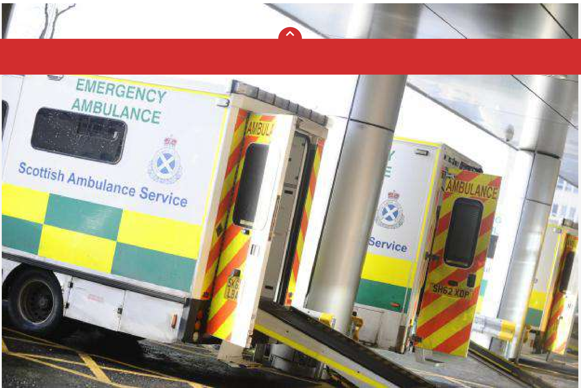
Emergency patients facing six-hour delay outside Glasgow hospital amid beds crisis

EMERGENCY patients are facing six-hour waits to be transferred to Scotland's biggest hospital as health services nationally face "significant and sustained" pressure.