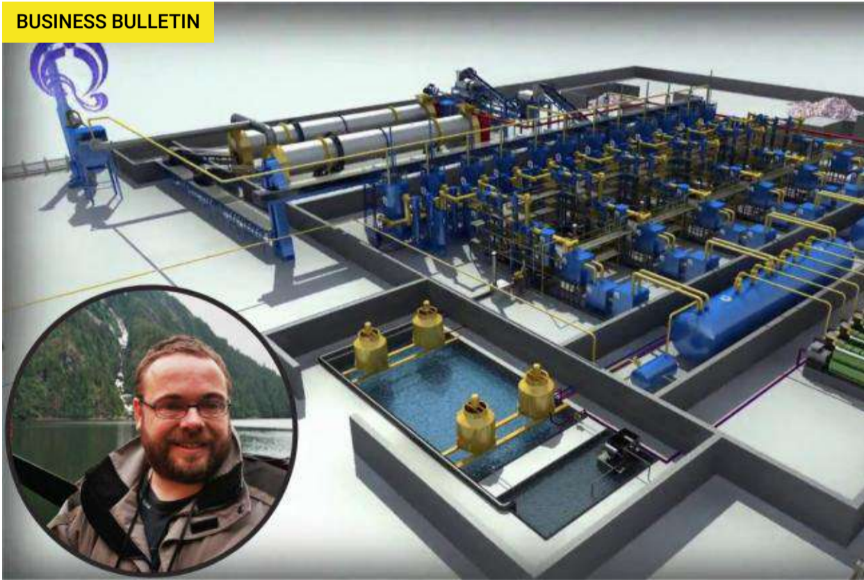
New £800m Scottish renewable energy park backed by Chinese giant unveiled